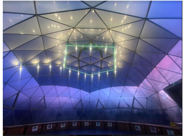
The Garden Room at Sun Set