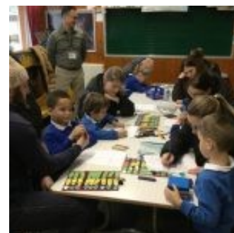
Year 1 Understanding Place Value