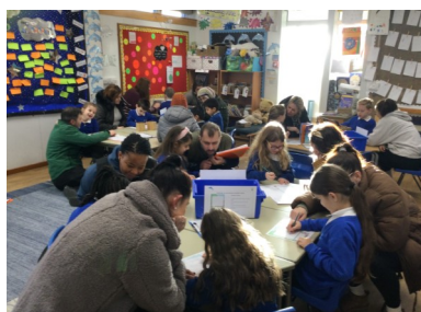
Year 2 Reading Together

It was great to see so many of you joining your children in the learning environment again this half-term. We hope that you find the sessions useful, and of course, fun! As always, we understand if you can't attend, so a family member, child minder, family friend is welcome to attend in your place. If no one can attend, staff complete the activities with the children, ensuring that everyone benefits.