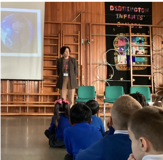
Dame Mary Archer fascinated us with facts about our planet and the solar system.

Dame Mary Archer: In her role as a celebrated scientist, specialising in solar power conversion, Dame Mary talked to the children about our planet, including how and why we should look after it. The children (and adults) were fascinated, asking lots of questions.