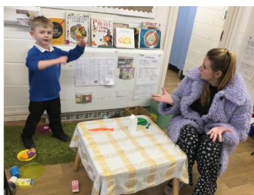
Early Maths in Reception